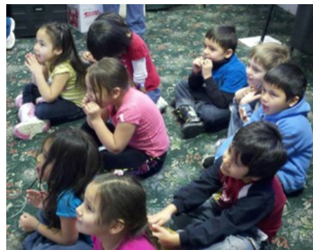
Children's Day at the Capital ...waiting